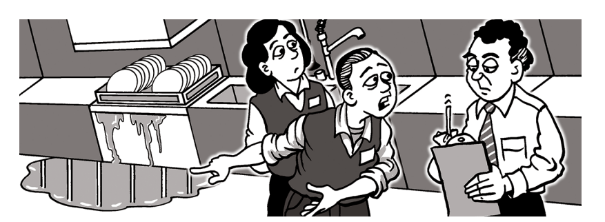
The law protects you when you speak up about safety.