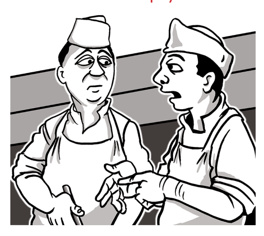
If you have concerns, get help.

Sometimes, employers call workers "independent contractors" to cut corners and avoid paying taxes. Even if your employer does this, you may be an employee under the law and have all the rights as an employee.