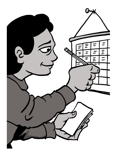
Keep track of your work hours.

A copy of the state's Wage Order for your occupation or industry should be posted in a place where it can be easily seen and read by employees, such as in a break room.