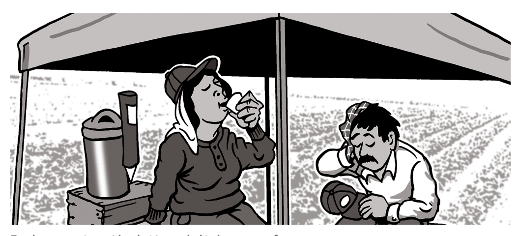
Employers must provide what is needed to keep you safe.