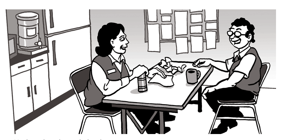
You have the right to take breaks.